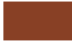
P-8004 Dark Copper