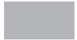
P-9006 Metallic Silver