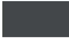
P-7011 Dark Grey