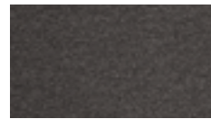
22-7003 Storm Grey