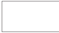
P-9003 Cool White