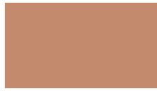
P-3012 Rose Bisque