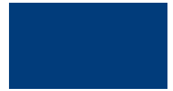
P-5005 Deep Blue