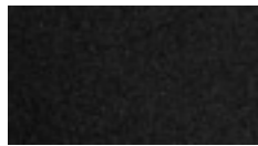
22-7001 Tuxedo Black