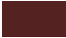
P-3009 Dark Red