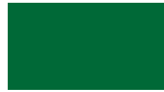
P-6029 Medium Green