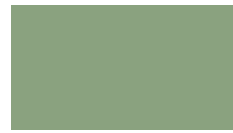
P-6021 Light Green