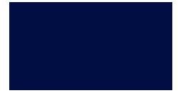
P-5011 Dark Blue