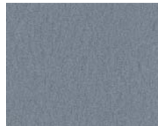
22-7002 Pachyderm Grey