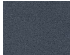
22-7003 Storm Grey