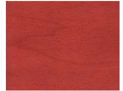
W-63 Red Currant