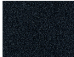
22-7001 Tuxedo Black