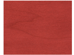
W-63 Red Currant