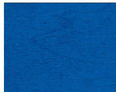
W-94 Royal Blue