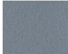
22-7002 Pachyderm Grey