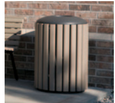
SLR-27B-AL waste receptacle