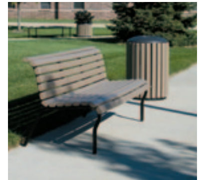
B322 B-72 bench and SLR-27B-AL