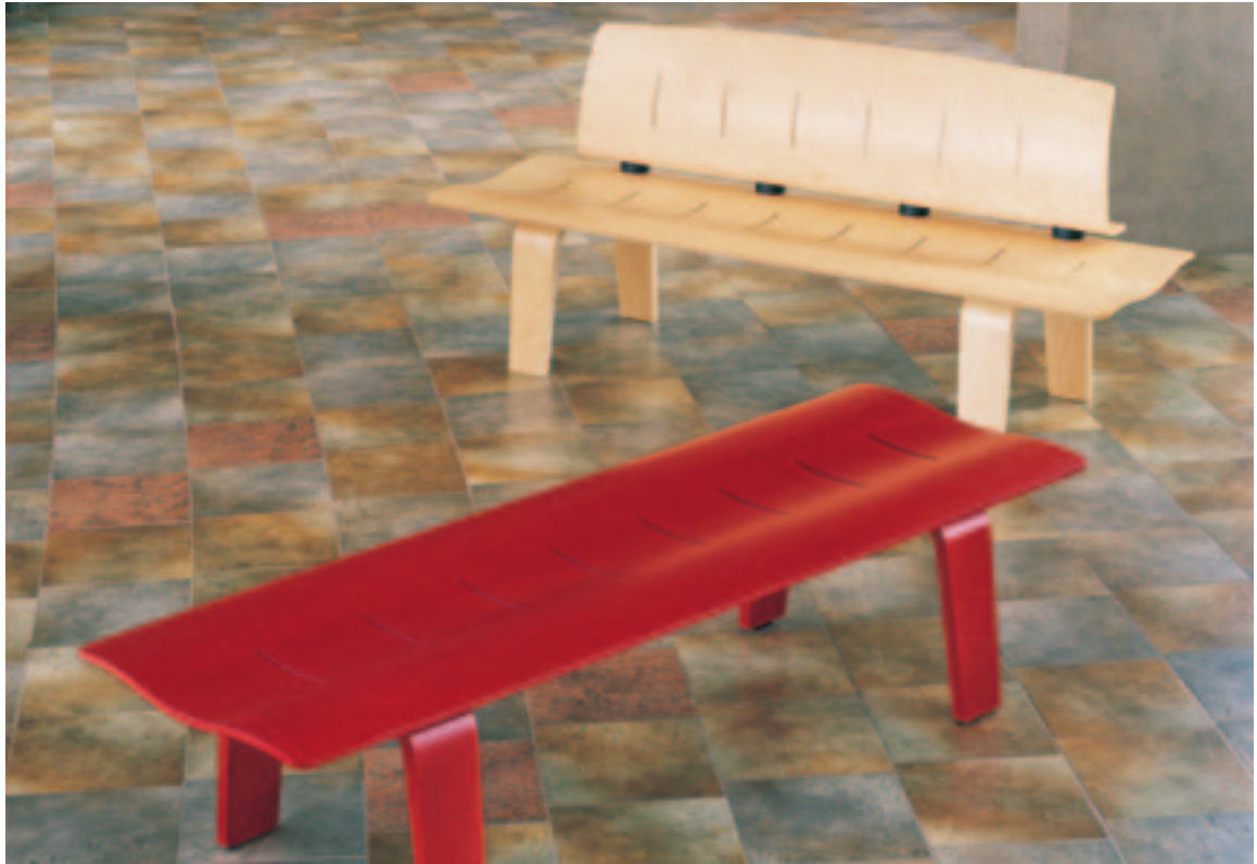
B321 A-HWW-7222 and B321 B-HWW-7222

To specify color: Choose maple stain from colors shown. If steel legs are specified, see color page C-6 for steel powder coat colors.