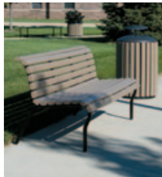
B322 B-72 bench and SLR-27B-AL with optional rain cap