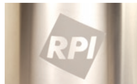
Precision laser cut or etched logos may be specified to identify a university or corporation.