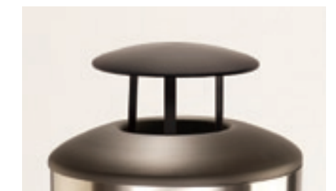
Shown to the left is the STX-22-W-SS unperforated (optional). Shown above is the aluminum rain cap option.