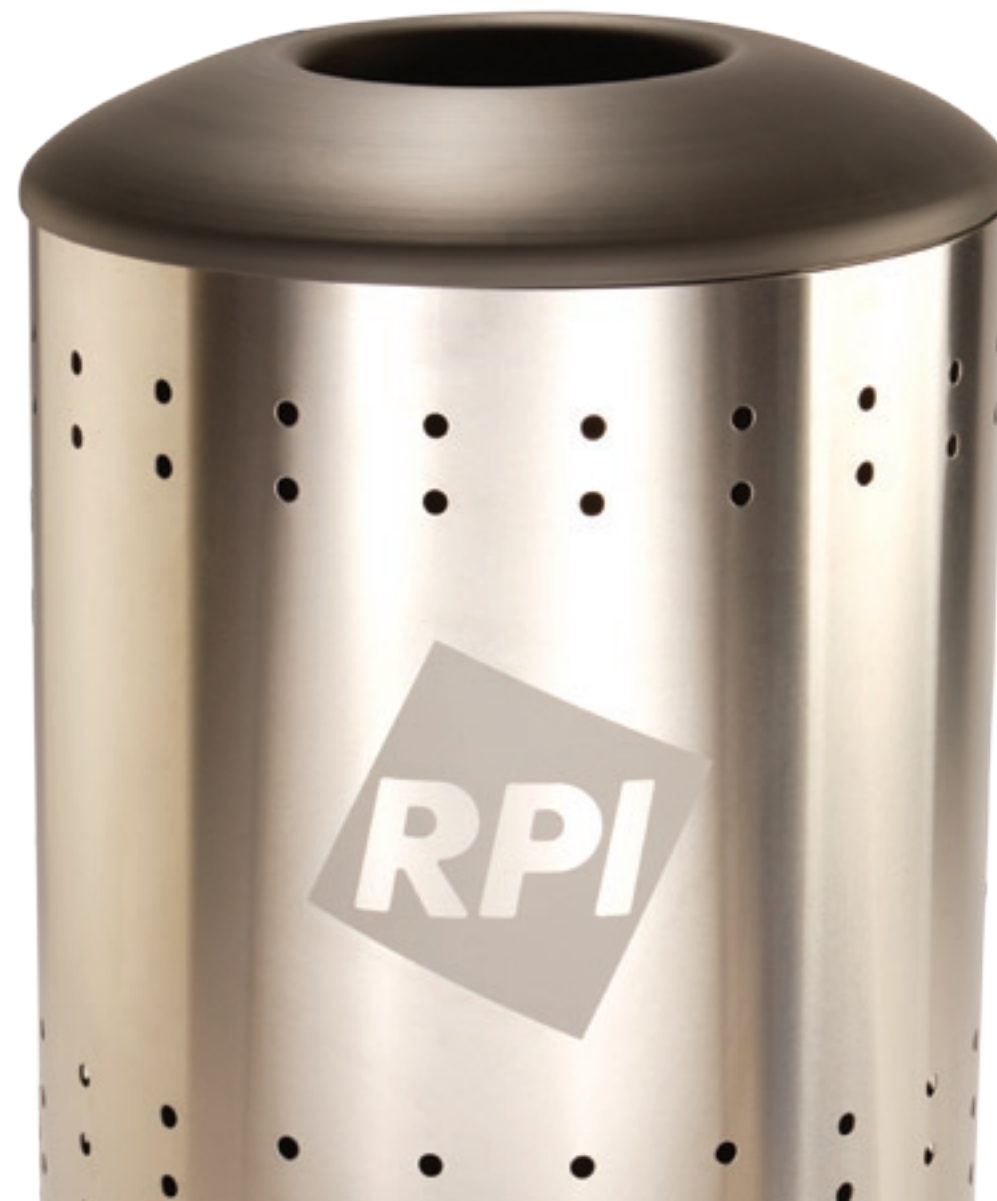
Pictured on the cover is the STX-22-W-SS unperforated (optional). Shown to the right is the STX-27B-AL-SS with optional etched logo.