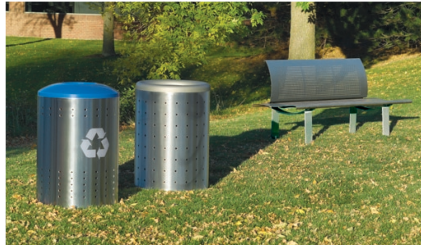
Elegant, durable and virtually maintenance-free, the STX stainless steel receptacle is an excellent choice for recycling in public spaces.

Uses are almost infinite – shopping malls, educational institutions, airports, public spaces and health care.