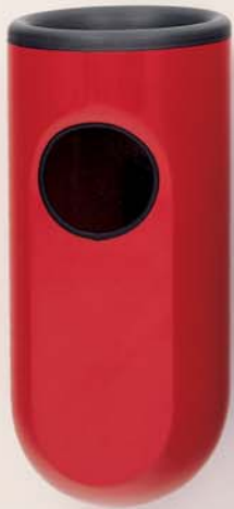
HF-9-A with optional trash hole